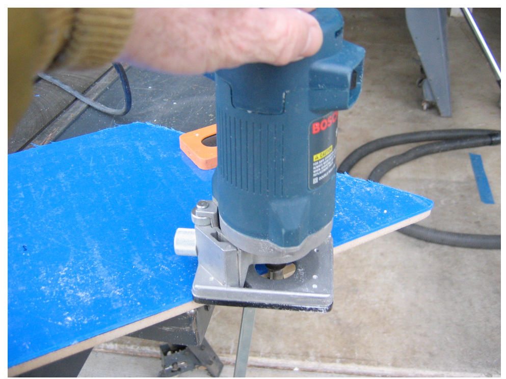
Laminate router cutting out acrylic. Note clamps used to stabilize acylic sheet against masonite pattern.

The sliding portion of the windows have ¼" thick acrylic blocks (1"x1/2") cemented to the window. I used commercial acrylic cement for this purpose. If you choose to use Lexan for your windows instead of acrylic, those blocks will have to be cemented using epoxy cement. If you are going to do multiple windows, then you might consider making a template to locate these blocks in the same spots each time. Please