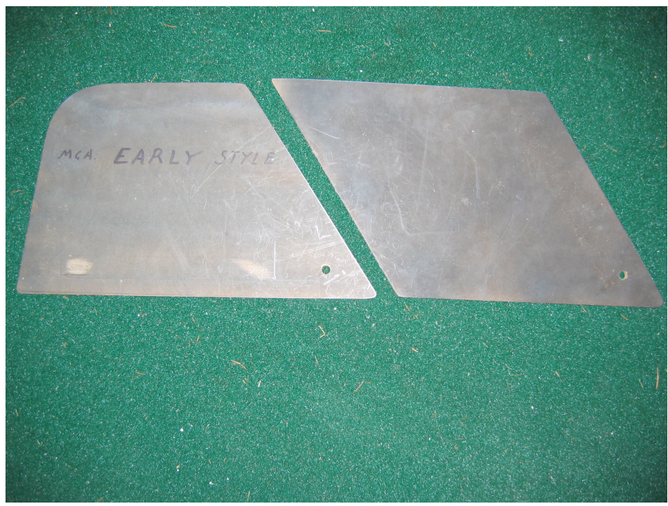
Masonite templates

bottom, cutting out the windows is a snap. After cutting out these windows, use a 150 grit sandpaper to smooth out the edges, then polish them using gentle pressure.